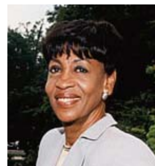
Rep. Maxine Waters

NCHV also worked closely with Senator Patty Murray (D-WA), Chair of the Senate Appropriations Subcommittee on Housing and Urban Development, to advance the issue of permanent supportive housing. In May 2008 Senators Murray and Tim Johnson (D-SD) Chair of the Senate Appropriations Veterans Affairs Subcommittee, conducted a hearing re-